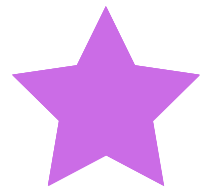
SECONDARY ENTRANCE TO CAMPUS (PREP DEPT. ONLY) VIA QUEENSWAY