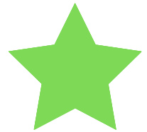
MAIN ENTRANCES TO CAMPUS