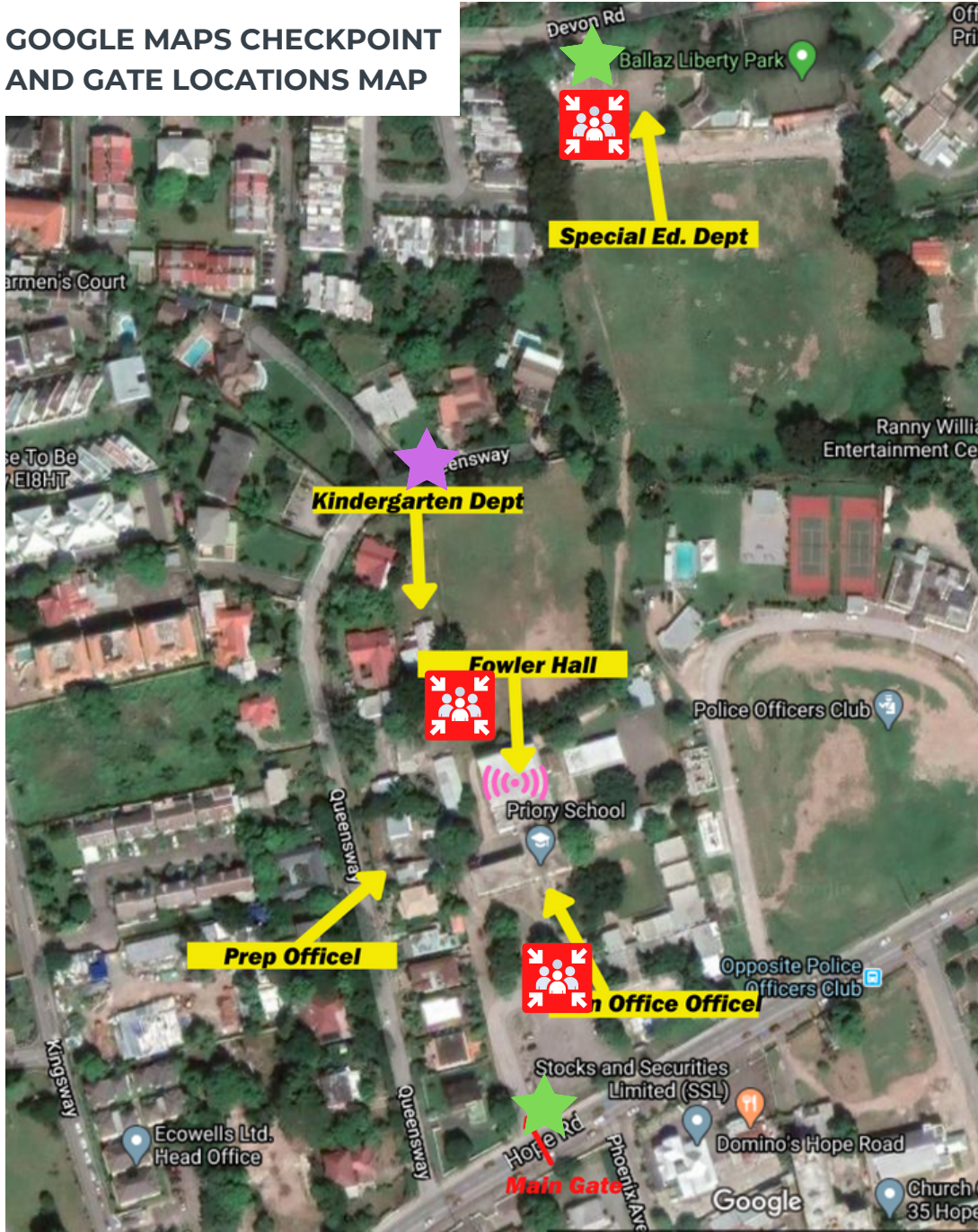
GOOGLE MAPS CHECKPOINT AND GATE LOCATIONS MAP